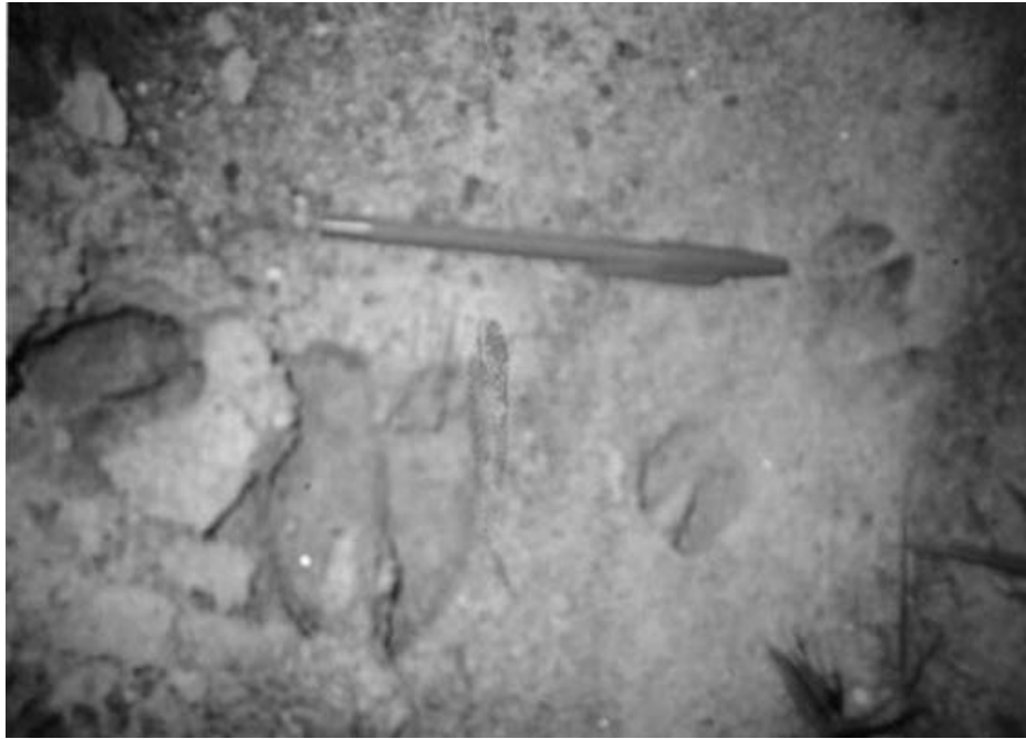
Figure 3. Foot prints of wild boar found in the cassava plantation next to the boundary of Way Kambas National Park