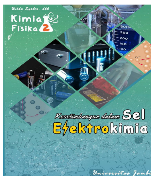
Figure 1. Book cover

experts, as well as student responses, to guide improvements in the learning media. Quantitative data, gathered through Likert-scale questionnaires, provided scores for evaluating the media's effectiveness and student engagement. Data analysis combined descriptive approaches for qualitative data and interval-scale processing for quantitative data, ensuring comprehensive evaluation of the 3D Pageflip-based Ideal Gas e-book as a teaching tool.