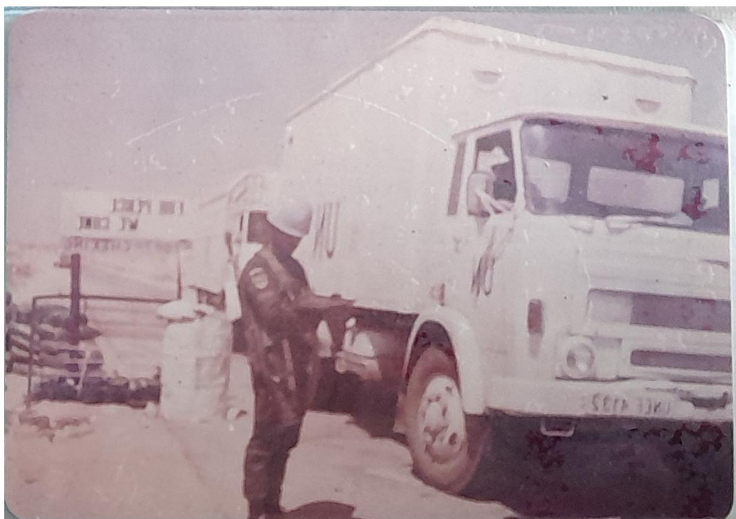
Figure 2. Logistic Truck in Egypt in 1978

A unique process in adapting further is the story of experiences narrated by the Tabi'in during his time in Egypt in 1978. He learned some words in Hebrew since he met, and even conversed with, Israeli soldiers there multiple times. Not only that, he even participated in several other activities with foreign soldiers, such as playing chess, playing in a band, and engaging in other leisure activities. In every activity, he had to communicate in various languages. In building communication, one interaction method was when the Tabi'in was forced to use sign language, as neither party was proficient in English as the international language for communication. This occurred because not all countries under the UN, representing peacekeeping forces, have English as their official language. 25